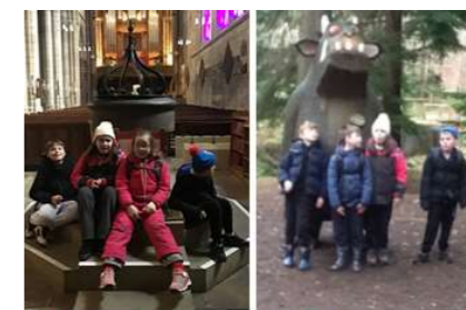
Hexham Abbey The Gruffalo Trail

This term in P3, students have been working very hard across all areas of their curriculum, particularly through outdoor educational visits that enhance their studies in Art, Design, Religious Education, Geography and physical fitness.